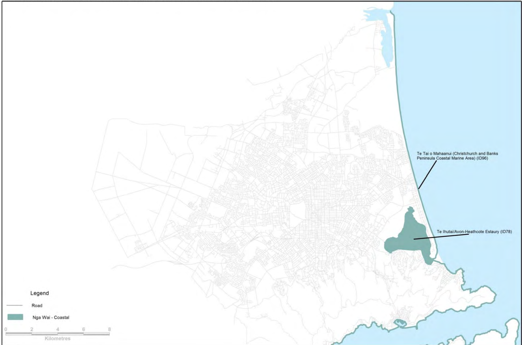
9.0.5.6 Map 3: Ngā Wai - Te Tai o Mahaanui (Christchurch and Banks Peninsula Coastal Marine Area) – ID 96